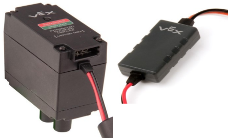
Silver Membership; 6x sponsors