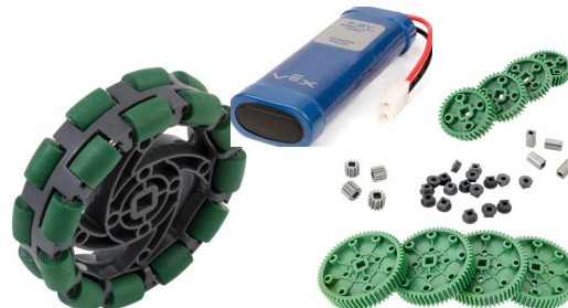
Bronze Membership; 12 sponsors