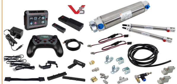
Gold Membership; 6x sponsors